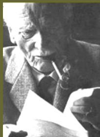
Carl Gustav Jung

Box 219 – 1917 West 4 th Ave. Vancouver B.C. V6J 1M7 604-261-1590 January 2009